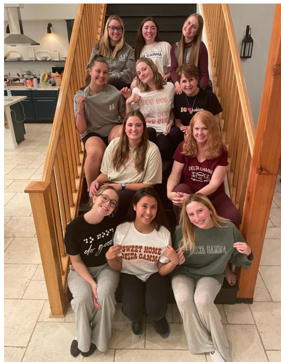
The Hope Serving 2023 Team!