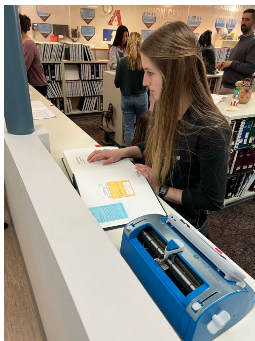
Exploring Braille resources in the media centre.